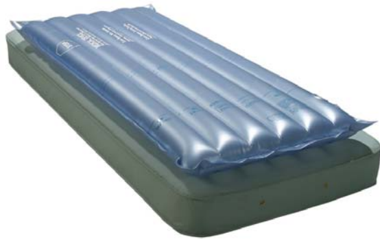
REF 14400 shown