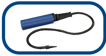
14426 (Manual Pump)