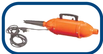
14427 (Electric Pump)