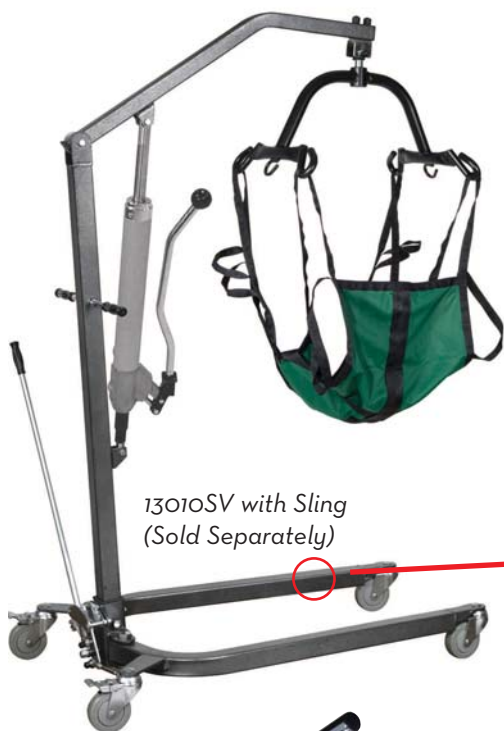
13010SV with Sling (Sold Separately)