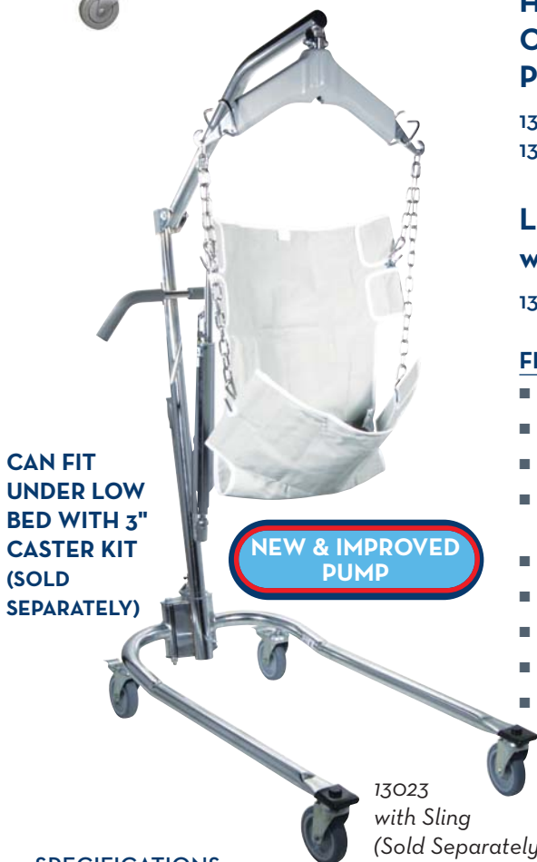
13023 with Sling (Sold Separately)

CAN FIT UNDER LOW BED WITH 3" CASTER KIT (SOLD SEPARATELY)