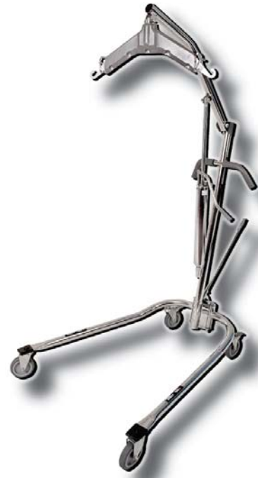
Item # 13023