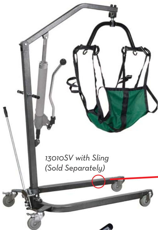
13010SV with Sling (Sold Separately)