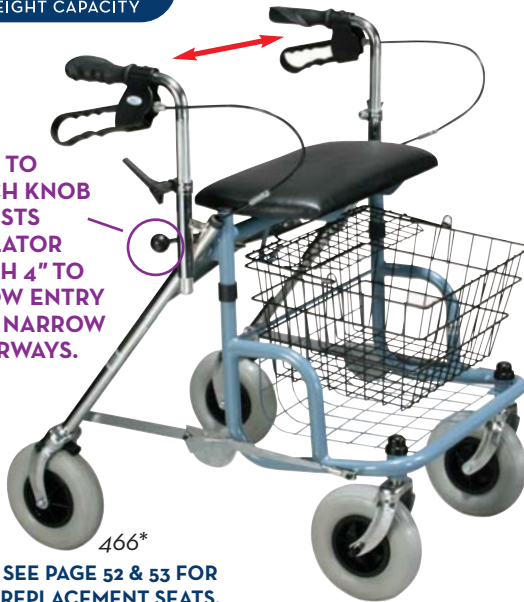
466* SEE PAGE 52 & 53 FOR REPLACEMENT SEATS.

EASY TO REACH KNOB ADJUSTS ROLLATOR WIDTH 4" TO ALLOW ENTRY INTO NARROW DOORWAYS.