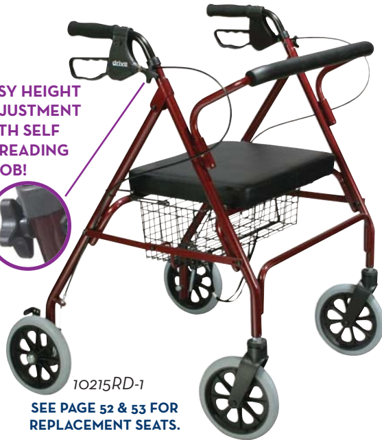
10215RD-1 SEE PAGE 52 & 53 FOR REPLACEMENT SEATS.